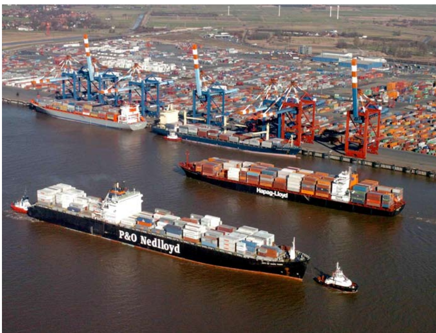
Bremerhaven is EUROGATE's Largest Container Terminal

Data from the Internet therefore has to get through two firewall systems before it reaches the EUROGATE LAN. However, its journey comes to an abrupt end at the first control point: the Application Level Gateway blocks the data packets, and a direct connection is never permitted. The system checks the packets, analyzes the contents, and blocks out harmful data, such as viruses or active Web content.