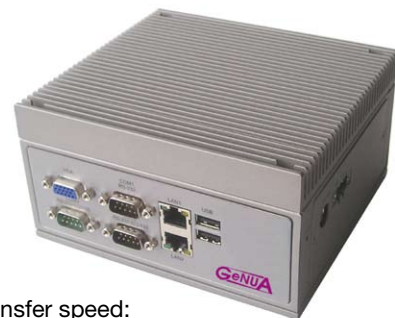
Increases transfer speed: Compact Security Platform GeNUBox

distance outward and return journeys add up to a round trip time of one to two seconds. This significantly delays the sending of the next packet, and thus the entire data transfer: a maximum data throughput of only 100 to 150 kbit/s is achieved, although these days satellite connections offer much higher bandwidths. The result are long transfer times and high costs. Satellite service operators will therefore offer you the option of compressing your data in order to make better use of the actually available bandwidth. However, this is not a solution, since only unencrypted data can be compressed. You would therefore have to send your data to the provider as plain text, which is something you should never do.