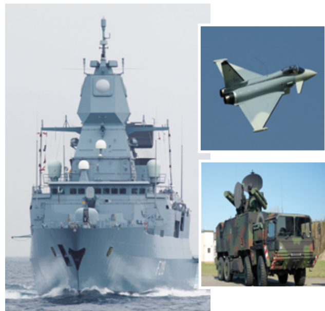
RSGate is flexible and versatile

RSGate is very versatile – it may be used in both static and mobile installations, e.g. land-based, on ships or in vehicles. Thus network interfaces in multi-dimensional operational environments and throughout all military branches can be controlled.